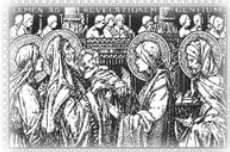
St Dorothy St Romuald